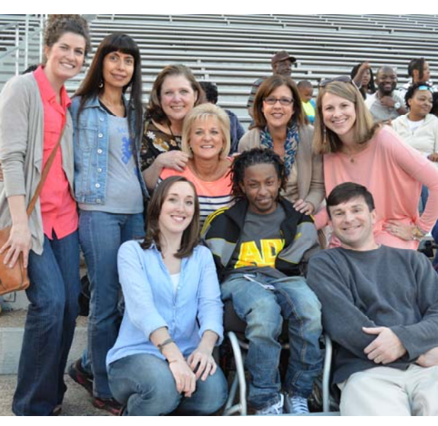
Charity Bowl—page 2