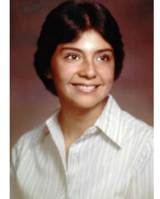
Guess who? — page 2

Nationally Recognized Center of Excellence for Rehabilitation