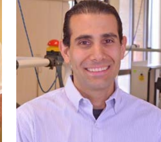
Navigator Program to help with transitions —page 5