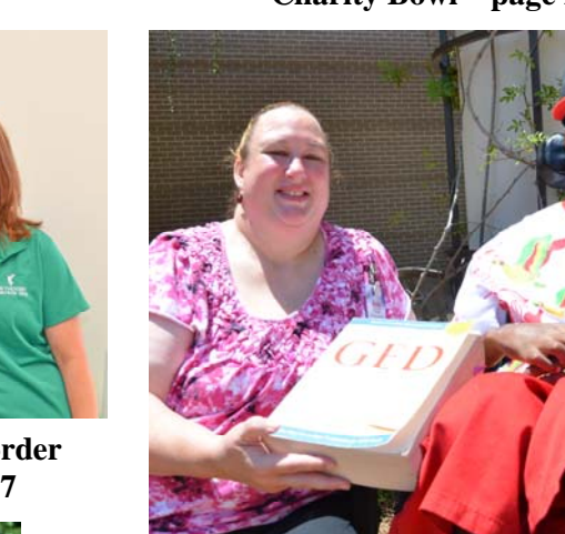
Obtaining GED and looking toward college—page 3