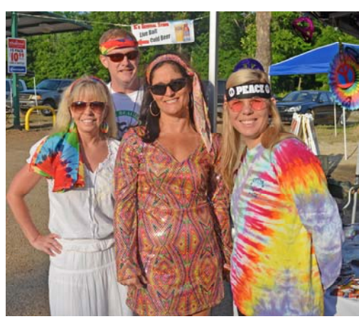
Bike Crossing ride—back cover