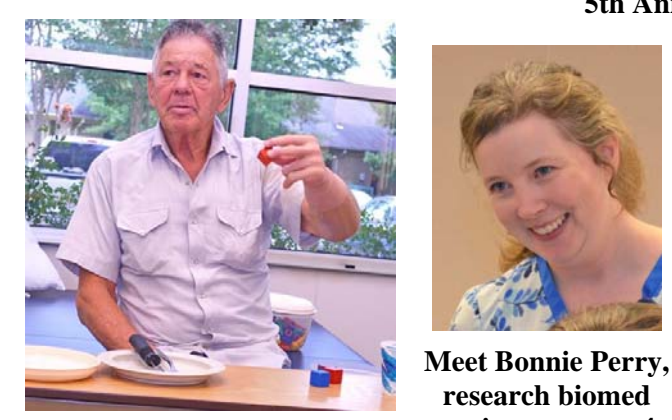
Bionic hand—page 4