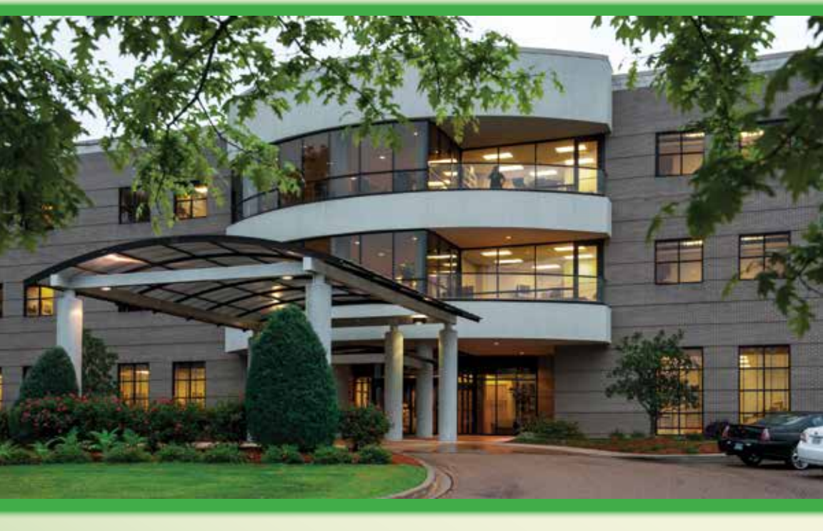
specialized care. exceptional setting.